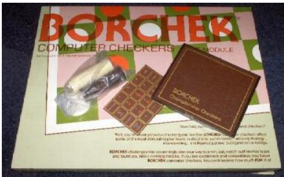
Borchek computer checkers module

Boris HANDroid (prototype) was also designed to be able to move checkers! But whether this robot actually played checkers will always remain a question. Perhaps during the Nürnberger Spielwarenmesse in 1981? Other rumours indicate that the Handroid could only display the notation via the LCD, but that seems somewhat unlikely to me. There was also talk that the checkers were modified in such a way that they could easily be moved with the robot arm.