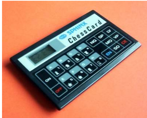
CXG Sphinx Chess Card - CXG-241

Van het origineel - CXG Sphinx Chess Card - zijn er nog twee versies verschenen: Schneider Chess Card en Fidelity Chess Card