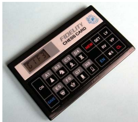
Fidelity Chess Card - model 6115