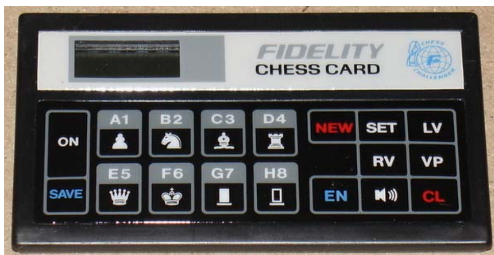
Fidelity Chess Card - model 6115