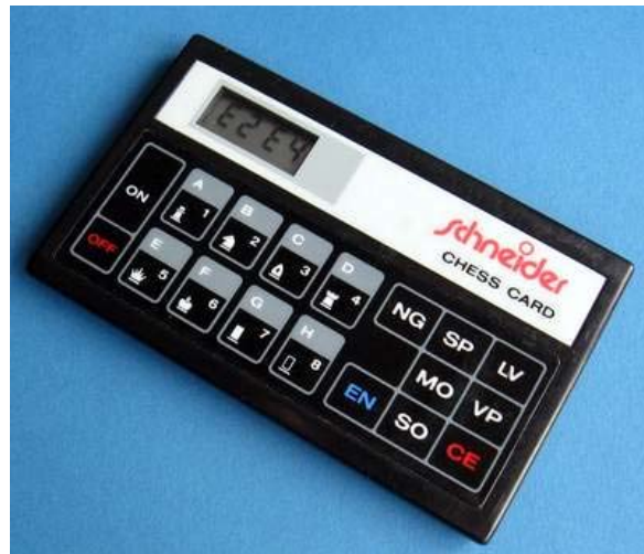
Schneider Chess Card - CXG-241