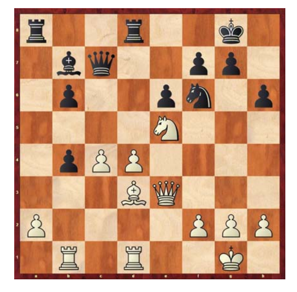
22.Rb1xb4± Ra8xa2 23.h2–h3 [Consolidates g4] [23.Rd1–b1 Nf6–d7 24.Ne5xd7 Qc7xd7± (24... Rd8xd7? 25.Rb4xb6 Bb7–c8 26.d4–d5+–) ]

20.Ba3xb4 a5xb4 21.Qe2–e3 Rc8–a8 [21...b6–b5!? 22.Rb1xb4 b5xc4 23.Rb4xc4 Qc7–a5=]