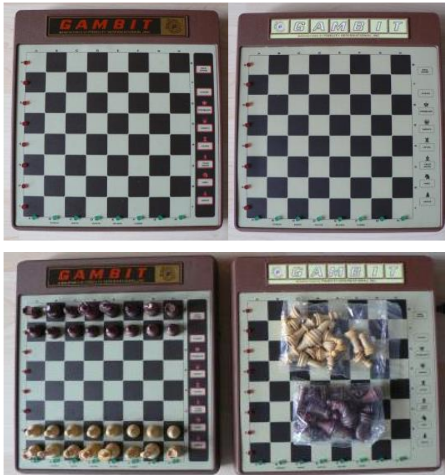
Links op de afbeelding = model 6084D (second edition) en rechts = model 6084 (first edition)

Ergens in het voorjaar van 1987 kwam Fidelity met een tweede uitvoering van The Gambit . De bedieningstoetsen waren duidelijker (groter) en de naamplaat kreeg ook een ander design.