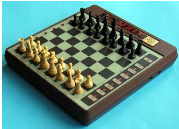
Fidelity The Gambit (second edition)