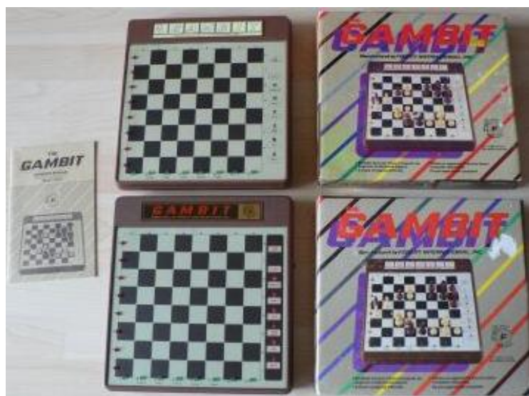
Op de afbeelding hierboven is goed te zien waar de verschillen zitten. Fidelity nam niet eens de moeite om de verpakking en handleiding aan te passen!